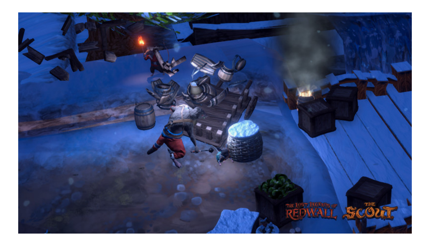
Download ->>->> http://bit.ly/2JY2nSi